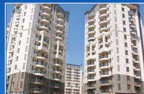
Mega City, Indirapuram, Ghaziabad