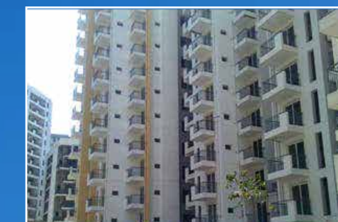
Aditya Urban Casa, Sec 78, Noida