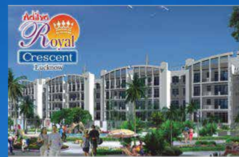
Aditya Royal Crescent, Lucknow