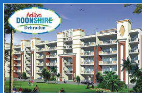
Aditya Door Shire, Dehradun