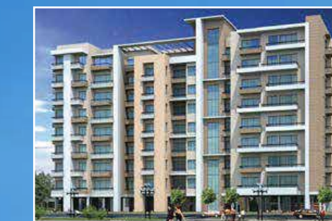
Aditya Royal Heights, Lucknow