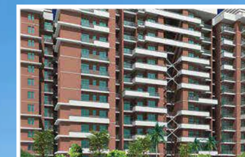
Aditya Imperial, Aligarh