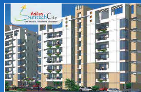
Aditya Suntech city, Ghaziabad