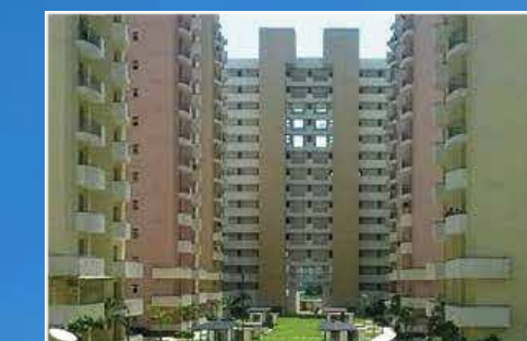
Celebrity Homes, Sec 76, Noida