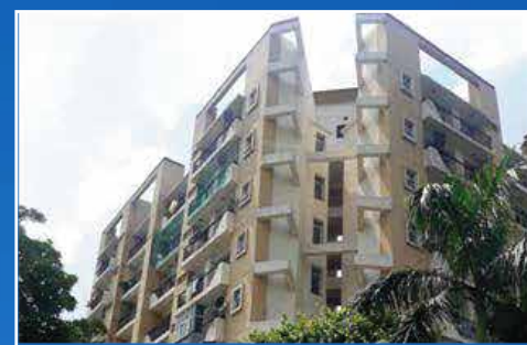
Aditya Garden City, Ghaziabad